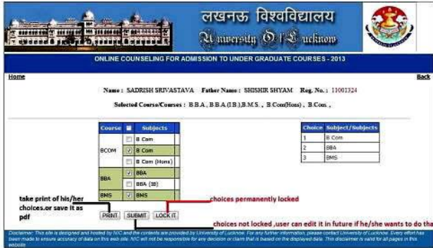
Figure 3: Course combinations for choice filling for candidates who have not opted for B.A.

Such candidates have to choose between the options in order of preference by clicking the check box before the course/subject. Rearrange the choices by unchecking/checking the boxes. The selected choices would appear on the right side of the screen in order of preference.