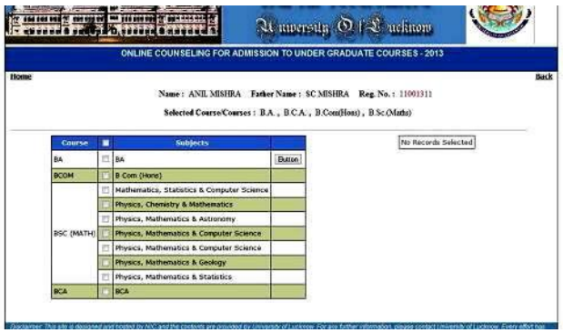
Figure 4: Screen for course combinations for candidates who have opted for B.A., B.Com., B.Sc. (Maths) and BCA

11. वे अभ्यर्थी जिन्होंने बी०ए० पाठ्यकम में आवेदन किया है, उन्हें आकृति सं० ४ की तरह स्क्रीन दिखाई देगा। For candidates who have opted B.A. as one of the options the screen would look like figure 4