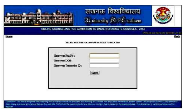
Figure 1: Screen for login

Candidates have to log in to the website using their registration number, date of birth and SBI Reference ID (Figure 1).