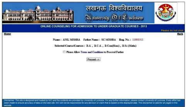
Figure 2: Screen showing the subject candidate details

7. लॉगिन करने पर उन्हें रिजस्ट्रेशन के समय भरे गये पाठ्यकमों का विवरण दिखाई देगा। On login they would see the details of courses submitted at the time of registration