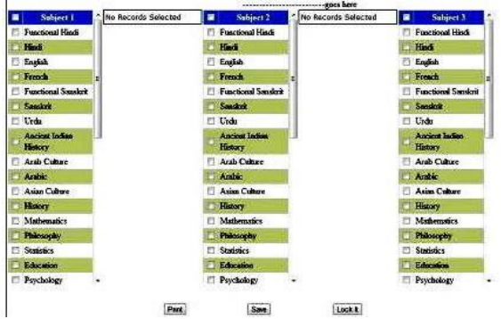
Figure 5: Subject options for B.A.

Such candidates would have to give the options for the three subjects separately from three column as shown in figure 5