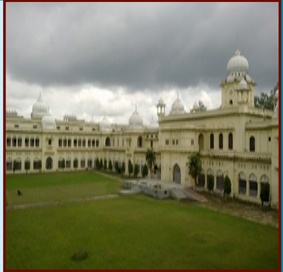
UNIVERSITY OF LUCKNOW

The students of Law Faculty participated in National and International Moot Court Competition of repute and have won accolades. Students participated in Lui-Brown John Marshall Moot Court Competition, Chicago USA, 2009. The Students won best memorial and spirit of surana award at Surana & Surana Moot Court Competition held at NLU, Assam in 2012. The Students also won accolades in Luthra Moot Court Competition. The graduating students have been successfully placed in leading law firms, multinational corporations & judicial services. Some students are also pursuing master programme in prestigious institutions like Yale, Cambridge, University college of London etc.