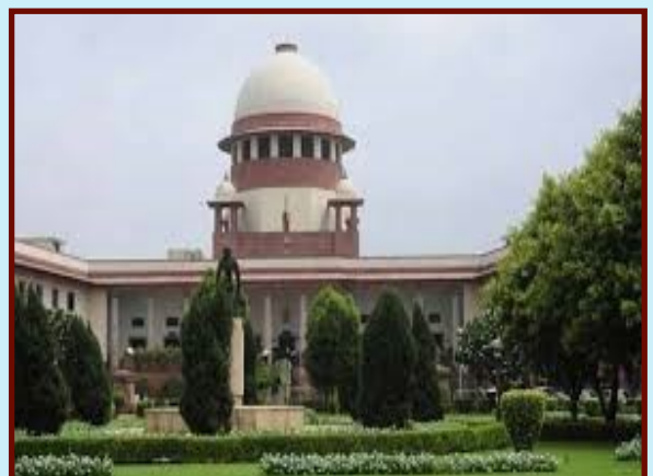
SUPREME COURT OF INDIA