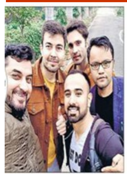
International students at UoL

University of Lucknow is serious about the health of its students and conscious of the danger SARS Covid-19 poses to the entire world. Therefore, the University postponed its annual examinations till the 2nd of April (subject to change as per Government guidelines).