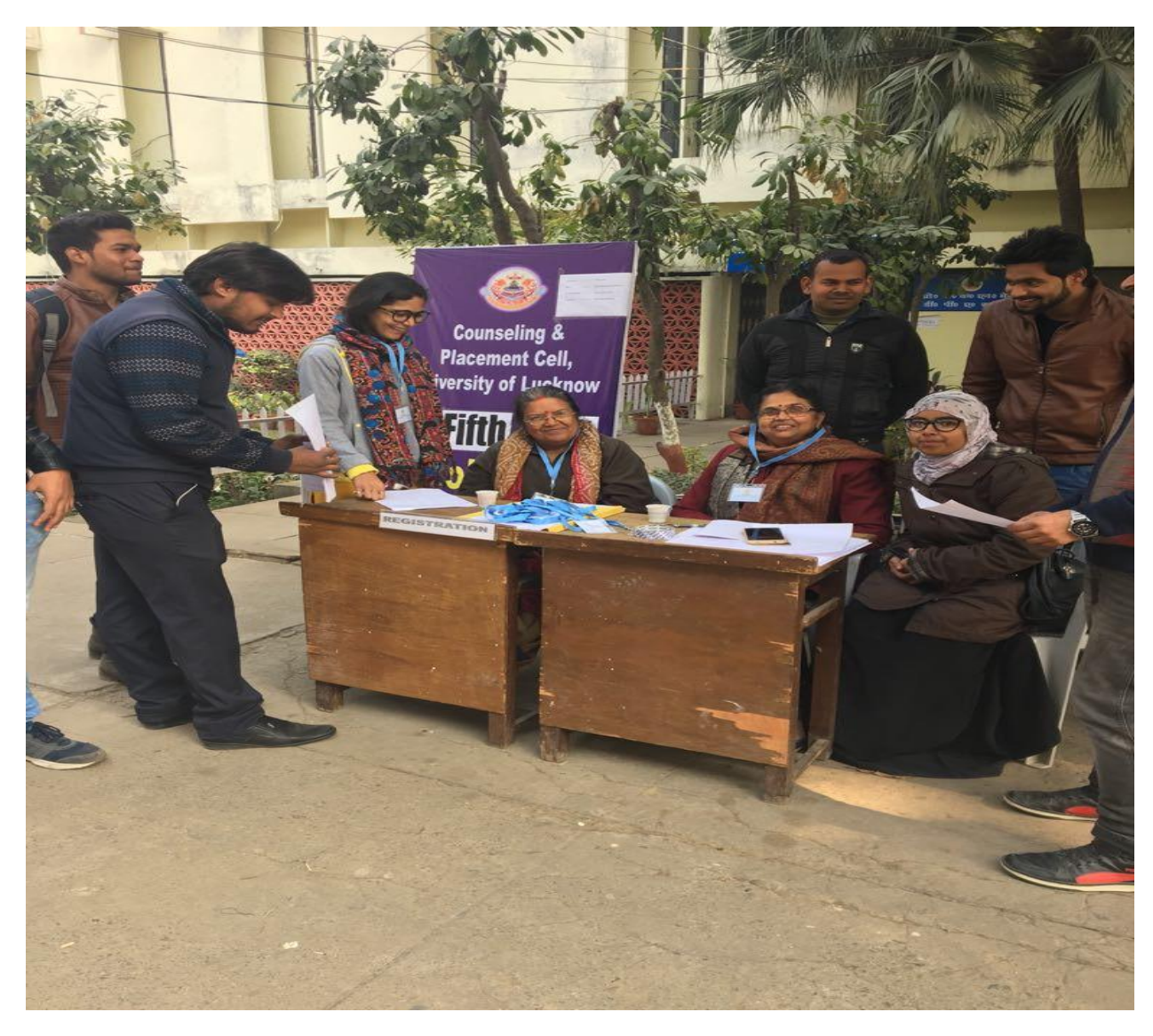
REGISTRATION DESK ALERTED