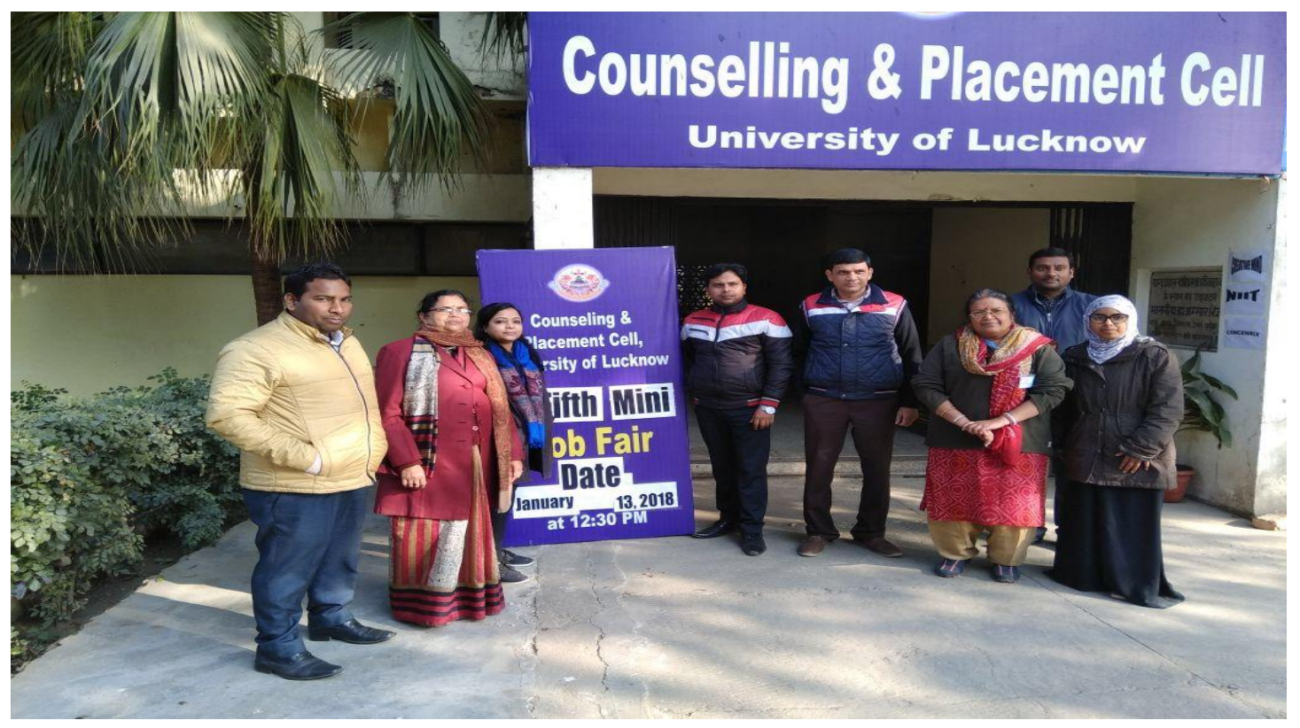
Team CPC with NIIT – preparing for placement drive