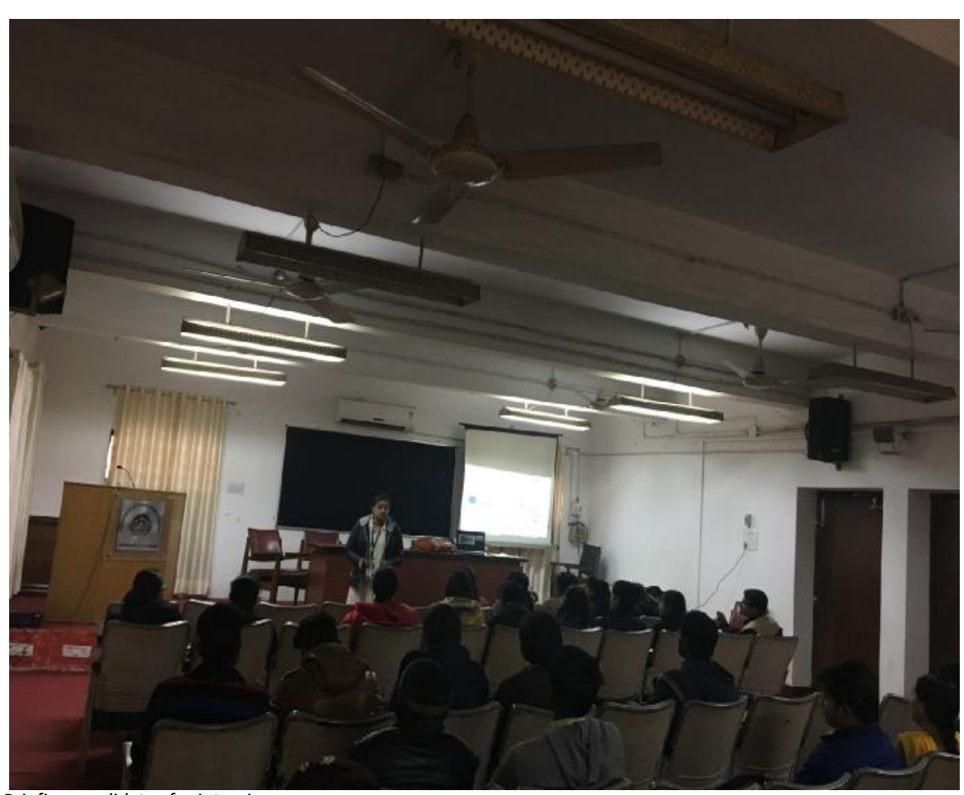
Briefing candidates for interview