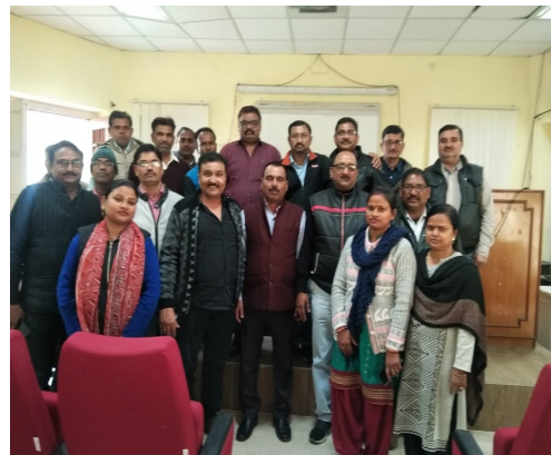
Participants of one day training program targeted at teaching how to use GEM portal