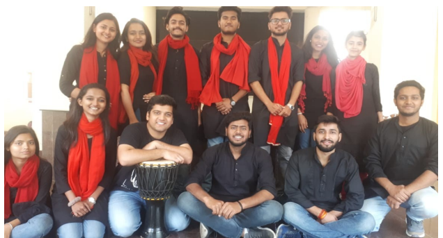
Some of the current members of Akshamya

Watch out for their upcoming performance on the occasion of International Women's Day!