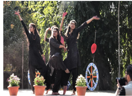
Scenes from Udaan and Vividha, the cultural festivals organized at Kailash and Tilak Hostels, and the annual inter hostel sports

The Cultural Festivals - Udaan of Kailash Hostel and Vividha of Tilak Hostel were held with great enthusiasm in mid February. A variety of cultural and sports competitions were organised for girl students. The week long Inter Hostel Sports Fest also happened this month. It started from 26th February 2020. Several cultural and