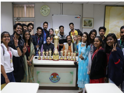
UoL students with their winning trophies

Students of the University participated in different cultural and athletic competitions held in Isabella Thoburn College's annual festival Aura-2020. Many of them won their respective competitions among competitors from several colleges in the state. Ultimately, the total points of University of Lucknow were the highest in the point tally and our students' team was awarded the coveted Champion of Champions Trophy. The victorious team met with the Vice Chancellor who congratulated them on their feat.