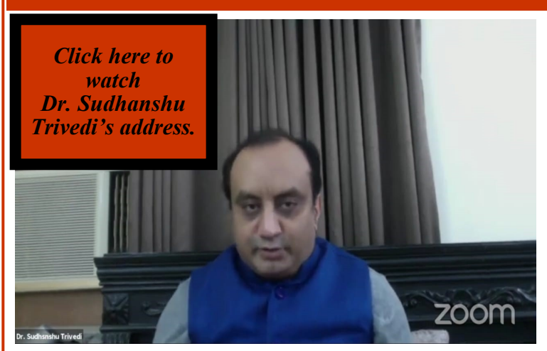
Hon'ble MP Shri Sudhanshu Trivedi delivering his lecture on National Education Policy: NEP2020 DECODED, amidst scholars and educators from the University.