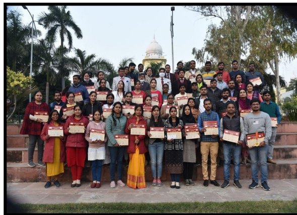
Winners of UDDEEPAN posing with the Hon'ble VC