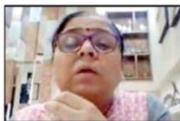
A teacher in a video call during OPD or Our Pupils' Day, an initiative to counsel students

Under the programme, a teacher has to reserve an hour on a designated day every week to counsel students on academic and personal issues. Students can walk-in to the teacher's chamber for one-to-one session. The twin objectives are to strengthen student-teacher bonding and help students to remain stress-free.