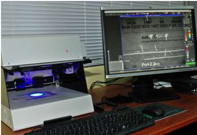
Fig: Video spectral comparator (VSC)

When a portion of the document has been altered and some portion is not clearly visible, or some text added. The VSC (video spectral comparator) can be used to decipher the alteration. The image is examined by viewing on a monitor, and digital image processing through a computer.