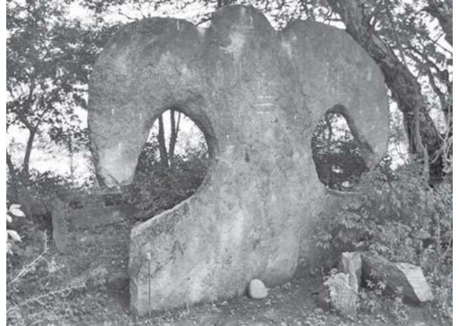
Anthropomorphic figure from Mottur