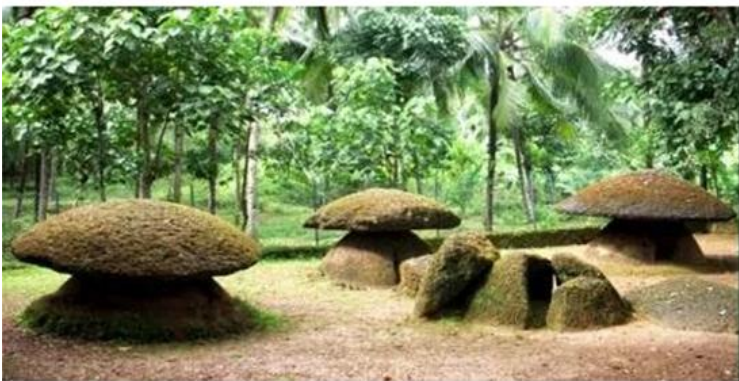
topikkal in Kerala