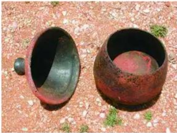
An earthen pot and its lid. in Adichanallur Tamilnadu