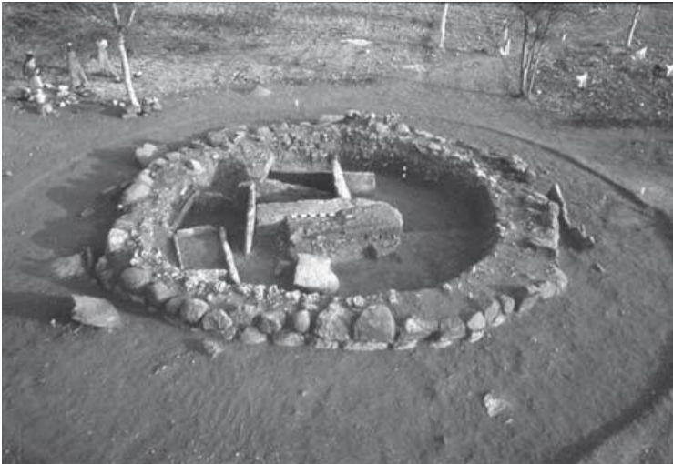
Cist entombing by stone circle at Kodumanal, TamilNadu