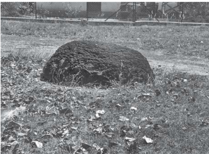
Kudaikal from Kerala