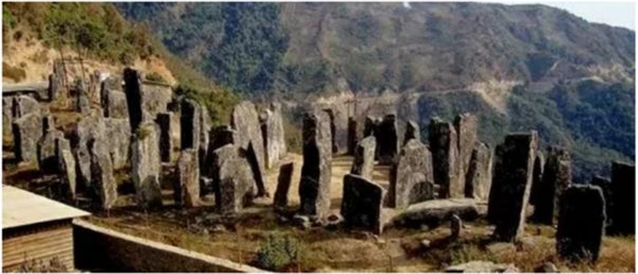
Menhir in Manipur