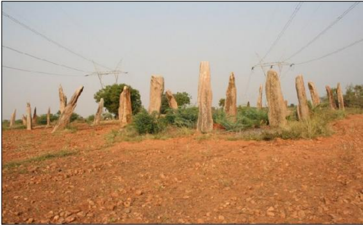
Figure 1: The overall view of the Nilurallu alignment as seen from the western side.