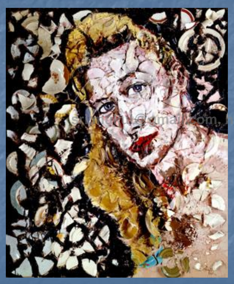
Actual textures can be felt with the fingers

An element of art, texture is the surface quality or "feel" of an object,, its smoothness, roughness, softness, etc. Textures may be Actual or Implied .