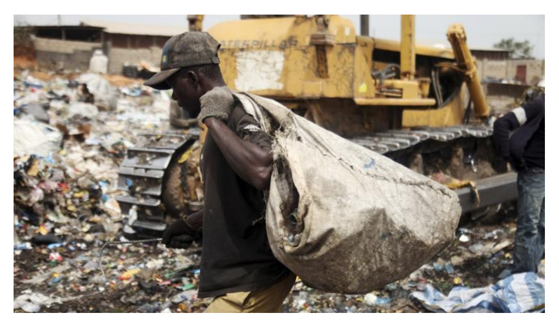
Figure 3: A young man picks up trash for recycling at the Olusosun dump, Lagos.

Africans emptying villages and funneling into cities have never paid much attention to the contention that African cities are built on an economic house of cards." Kaplan (1996) describes the large numbers of out of school unemployed male youth as "...loose molecules in an unstable social fluid that threatened to ignite." Since it is difficult to find a stable job, large numbers of young people have to throw themselves into the informal sector, which represents more than 70% of economic activity in most sub-Saharan African countries (Internatioal Labour Office 2009). For instance, recycling and reusing trash has become an ordinary practice in urban Africa. In cities like Lagos, Kinshasa, and Nairobi, people at the end of the social scale have no choice but to rely on recycling used substances from the trash (Figure 3). The CTA production Omo Dumping ("garbage boys") explores the life story of teenagers living on a dumping site in Bàrígà, Lagos. In it, three brothers move to the mega-city with the dream of a modernized world, but finally they become "omo dumping" just like many other young people who could not find jobs in the city. When receiving a call from their mum who still lives in the rural area, the three brothers make up a story of a "treasure hunt" in the city, instead of telling the truth that they have been wandering in piles of rubbish all day long.