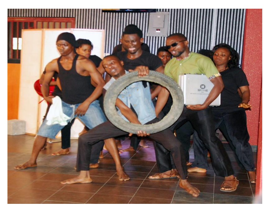
Figure 2: Stage photo of Eko Dialogue, the early morning "danfo" ride

situation turns violent, leaving the passenger exasperated. In this production the automobile becomes a site of heightened representation of daily commuting experience rather than an instrument enhancing the circulation of residents through urban spaces. The audience laughed when they saw the decently dressed passenger cursing furiously. This is the moment when the audience identifies with a moving and oppressed body and forms a consensus on the urgent nature of the "danfo" problem in Lagos.