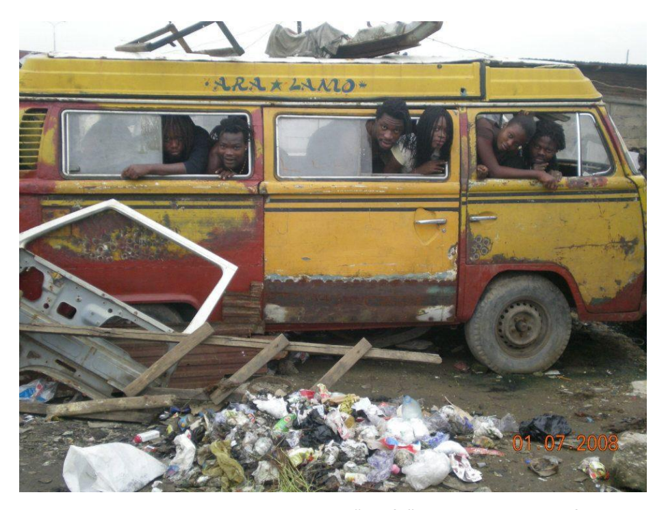
Figure 4: CTA actors sitting in a deserted "danfo". Rehearsal photo of Qmo Dumping , dump site in Bàrígà, Lagos

The movement of people, objects and ideas in the dynamic web of the city, the beat and rhythm of Bàrígà slum, inspires Adefila's artistic creation.