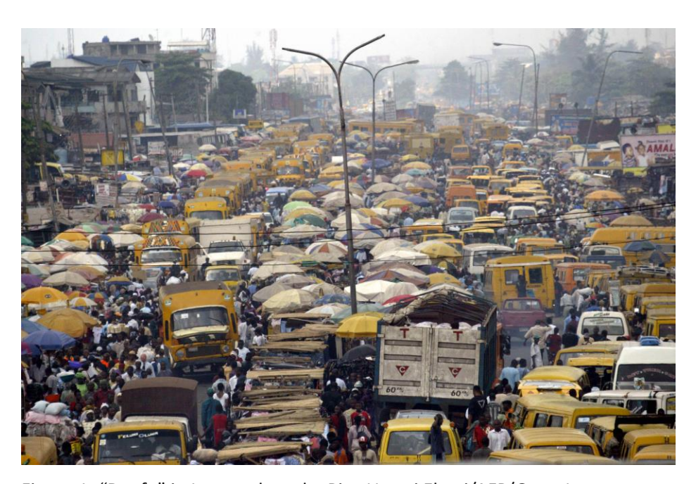
Figure 1: "Danfo" in Lagos

With an explosive population of over 20 million people, Lagos has been battling with the problem of finding a suitable means of conveying this vast population of residents from one place to another. The most common way of commuting is what local people call "Danfo" (or "Molue"): the overcrowded yellow mini-bus (See figure 1). In several productions, the actors recreate an image of sitting in a "danfo" and retell the consequence of the "crazy" driving style of Lagos drivers, which has become one of the major reasons for Lagos' notorious traffic chaos and frequent road accidents.<sup>2</sup>