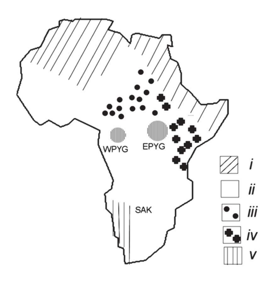
Fig. 1 - Geographic location of major groups of ancestral clusters within Africa. Patterns are identified by the number used in the text to describe the population composition of each group of clusters. WPYG=western Pygmies; EPYG=Eastern Pygmies; SAK= southern Africa Khoe-San. For details see text (modified from Tishkoff et al., 2009).

A final aspect of the recent advances in understanding genetic diversity within Africa is related to data analysis. Datasets based on multiple, independently evolving genetic systems are particularly well suited to simulation-based inferential frameworks which aim to distinguish between alternative models of population history and to estimate key microevolutionary parameters under a given model. Recent applications of rejection algorithms and Approximate Bayesian Computation to infer the branching history of