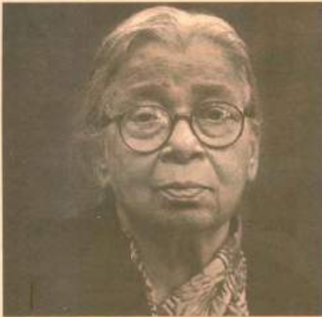
The Right to Dream: Mahasweta Devi (January 14, 1926-July 28, 2016)

Everyone knows the facts about her life. That she worked for the rights of tribals of West Bengal, Bihar, Madhya Pradesh and Chattisgarh. That she is remembered for her Draupati , Stanadhayini , Hajar Chaurashir Mau , Rudali and Aranyer Adhikar . That many literary awards came her way like the Sahitya Akademi Award and the Jnanpith Award, Ramon Magsaysay Award Padma Shri and Padma Bhushan—the most distinguished awards were given to her. SPARROW has made a long film on her life and her work. But it is what she spoke in her Jaipur Literary Festival address in 2013 that keeps resounding in one's ears. She concluded her address with these words: