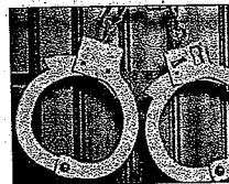
FOR REPRESENTATION ONLY