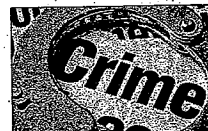
FOR REPRESENTATION ONLY