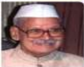
Shankar Dayal Sharma